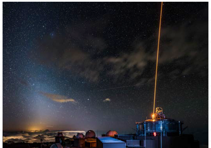
Sodium guidestar for sensing atmosphere at the Maui Space Surveillance System facility atop Haleakala.

The unique focus on research and development as well as operations provides a rapid development cycle from concept to operational implementation. Researchers are exposed to the actual needs of the operational space community and are able to provide innovative answers in an operationally relevant time frame.